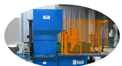
OPTION: BIN LIFTER

We reserve the right to make changes to specifications without prior notice. Bale weights are dependent upon material type.