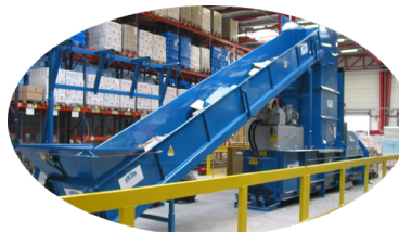
OPTION: CONVEYOR BELT